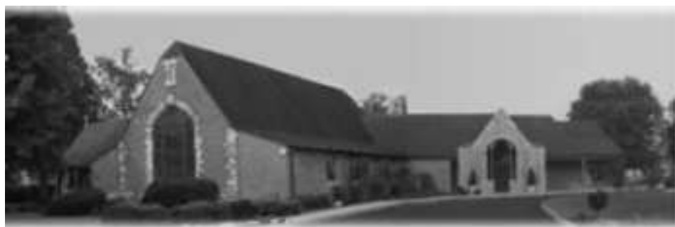
New home for EAM St. Paul's Episcopal Church, Kingsport, TN